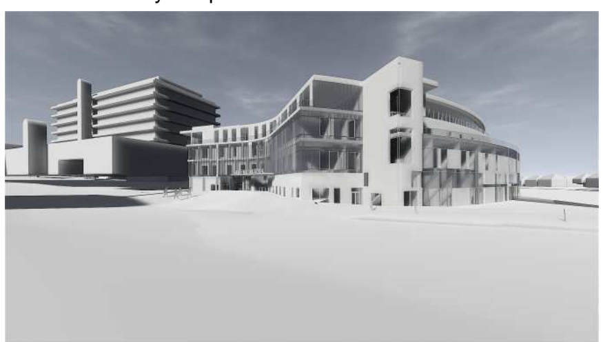
The ANCHOR Centre