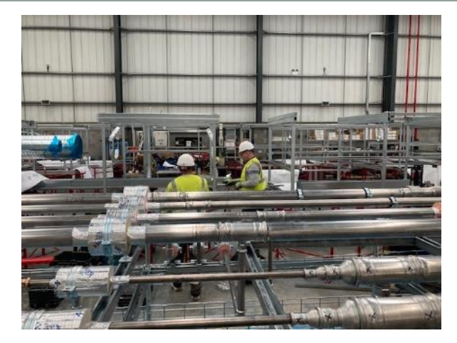
Factory visit to inspect services modules

The first of the modules have been arriving on site over the last couple of weeks and they are being lifted into place with the linked connections and quality control inspections being carried out to ensure the installation meets the relevant standards.