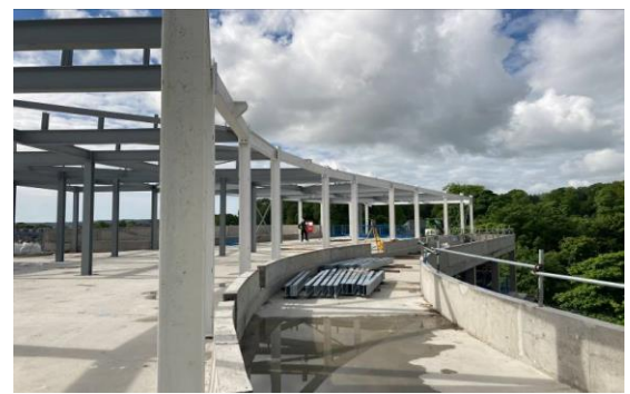
Formation of steelwork to create Engineering Plant Space on top floor of The Baird Family Hospital

rooms, and create the highest point on the building, is now underway. This is now a very impressive sight when approaching the Campus from Westburn Road.